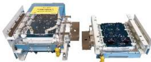
ZOPF Rotor & Line Side 1.5MW