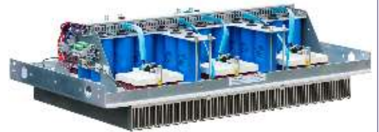
ZOPF RACK 314