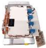
ZOPF NGx SKiiP 3