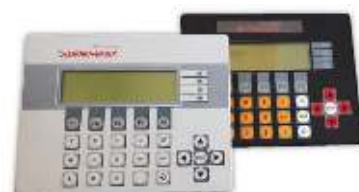
L&B Pitch Control