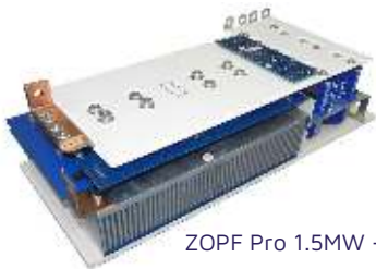
ZOPF Pro 1.5MW - Air