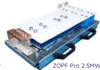
ZOPF Pro 2.5MW - Water