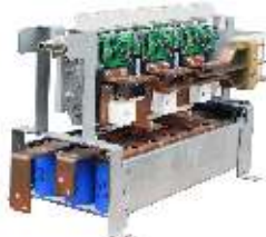
ZOPF IDS PU69