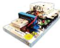
ZOPF NGx LightStack