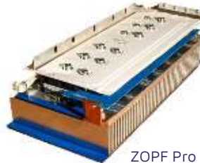
ZOPF Pro 2.0MW - Air