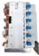
ZOPF NGx SKiiP 4