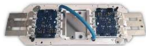
ZOPF Rotor & Line Side 2.5MW